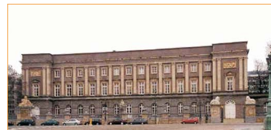
Academy House Hertogsstraat 1 / 1 Rue Ducale 1000 Brussels Belgium